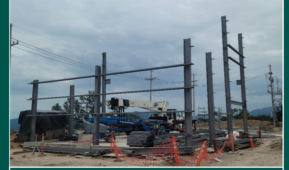
Plant maintenance building structural steel