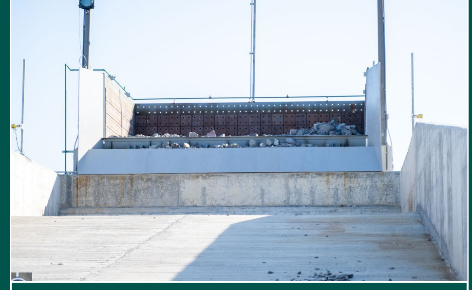
Primary Crusher feed dump