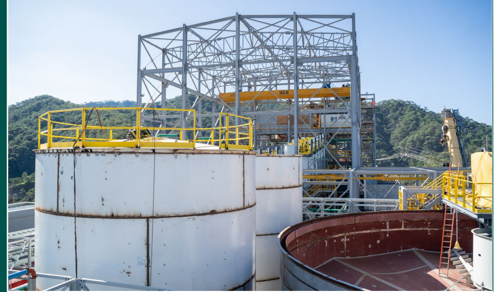
Raw and process water tanks welding over 90% complete